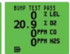
Configurable bump options