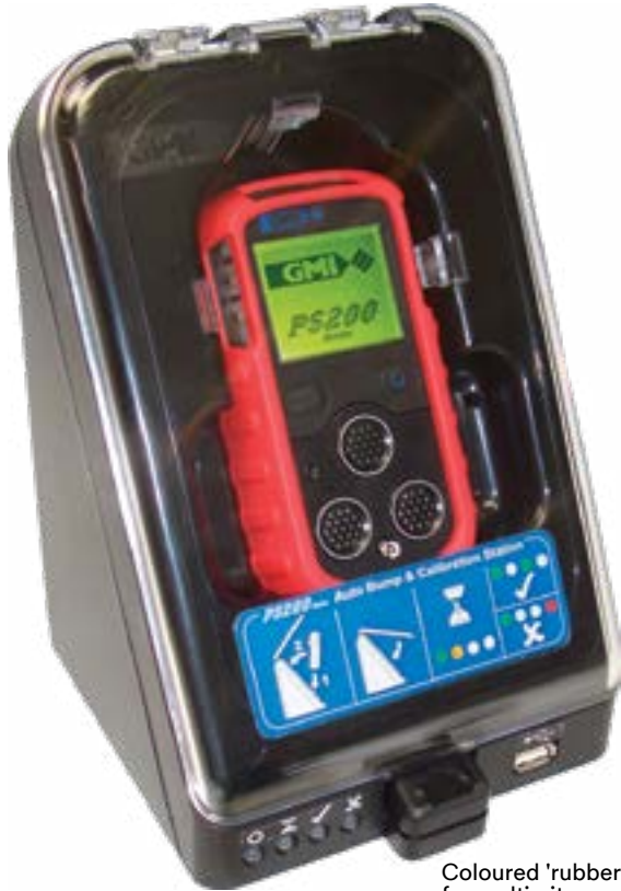
Coloured 'rubber boot' for multi-site or multi-application working (7 colours available)

To complement the Personal Surveyor product line, 3M has developed a compact, robust and easy to use Auto Bump & Calibration Station that can provide full bump and calibration options. Data transfer is facilitated using a USB memory stick with Standalone software that is simple to set up and customise based on end users' specifications. Standalone, PC, and ethernet versions are available.