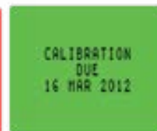
Configurable calibration options