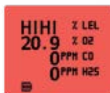
Red display in alarm conditions