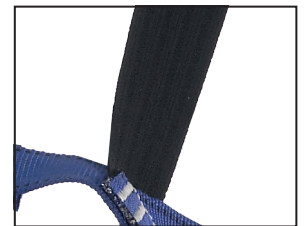
flexible shoulder straps