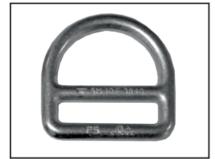
D-Ring geschmiedeter Stahl